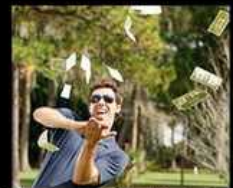
What my wife thinks I do