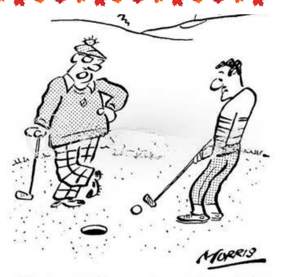
"As I see it, you've got a choice between a 'birdie' or a big sales order."